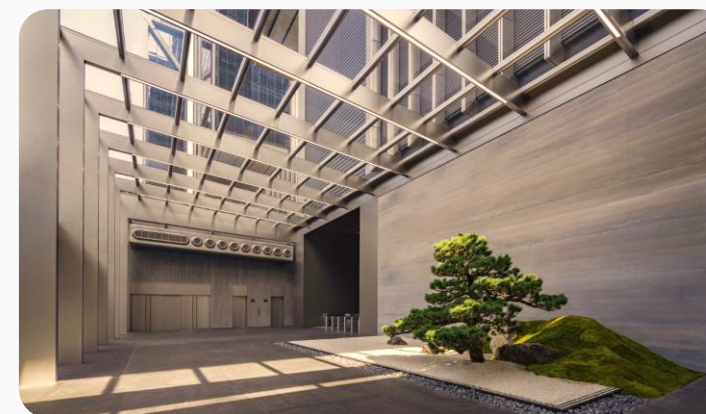
Lighting Reference [2]

The scene of this level is at dusk , so warm orange light is the main light outside this level. For indoors, use a red light source for the red team's base and a blue light source for the blue team's base.