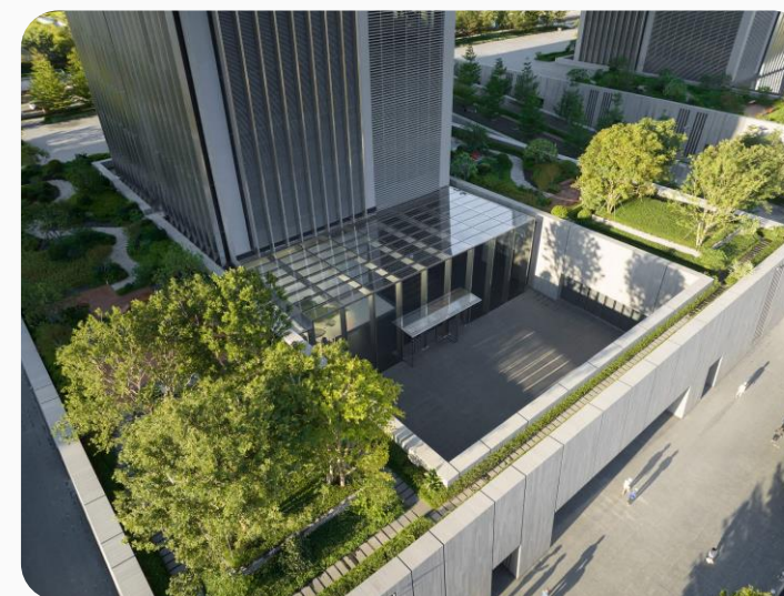
Hanging Garden Reference [1]

The overall art style of this level is modern . The bases of the two teams are located in two buildings respectively. The main conflict area is located in the sky garden between the two buildings. The sky garden is axially symmetrical with the central sculpture as the center. There are three levels, players can choose multiple routes to reach the opponent's base.